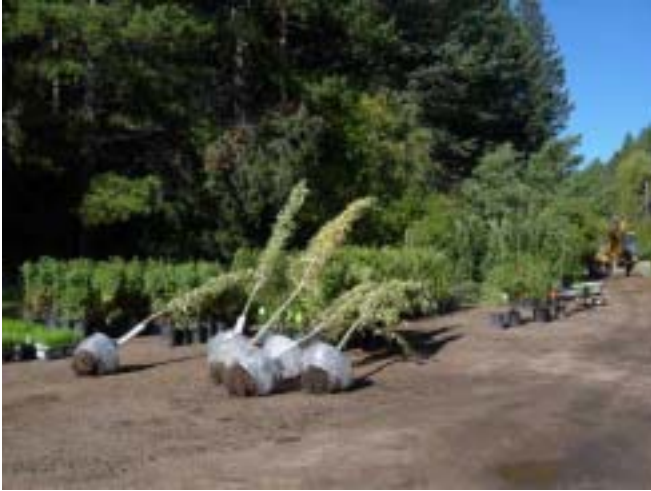
Hearty souls moved plants -- by wheelbarrow -- from this staging area to their new homes.

"THANK YOU" TO ALL WHO HELPED THROUGHOUT THE COURSE OF THIS PROJECT!!!