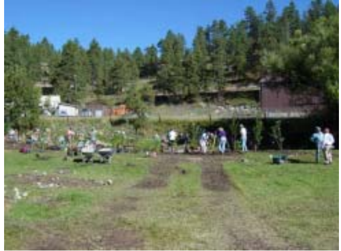
The 'tractor tracks' will have to be filled and seeded too. We couldn't have done it without all the volunteers!