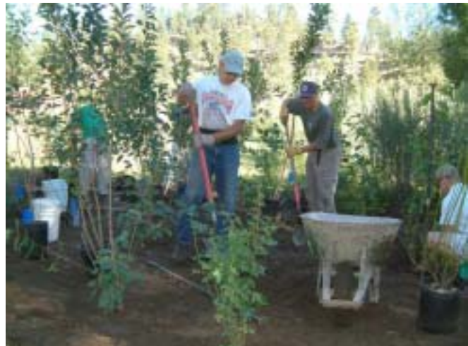
Hey Rich! Are you qualified to run that piece of equipment?