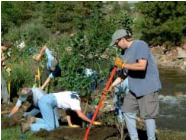
Then comes the fun part -- planting. How many softball-sized rocks did you jam your shovel into? Ouch...