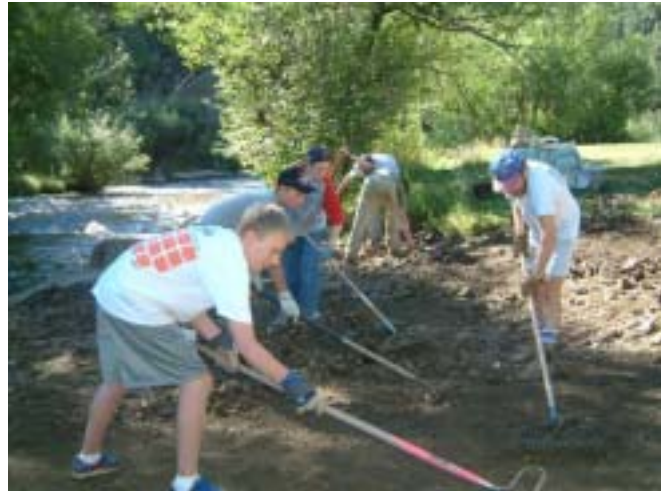
At least the kids paid attention during their training...