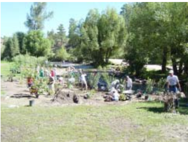
We're almost finished! Cold beverage anyone???