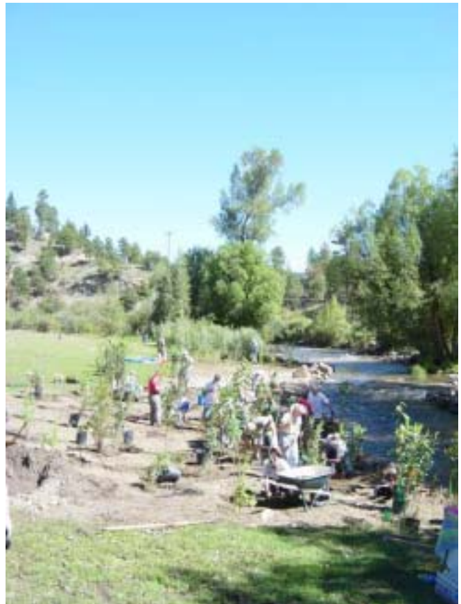
Before we started, the area being planted here was part of the wide, shallow streambed. The newly narrowed and deepened channel's riffle/pool structure will provide great year-round trout habitat. If you haven't been down to the park yet to see what we have accomplished, maybe you're due for a short trip down the canyon. This is what it's all about!