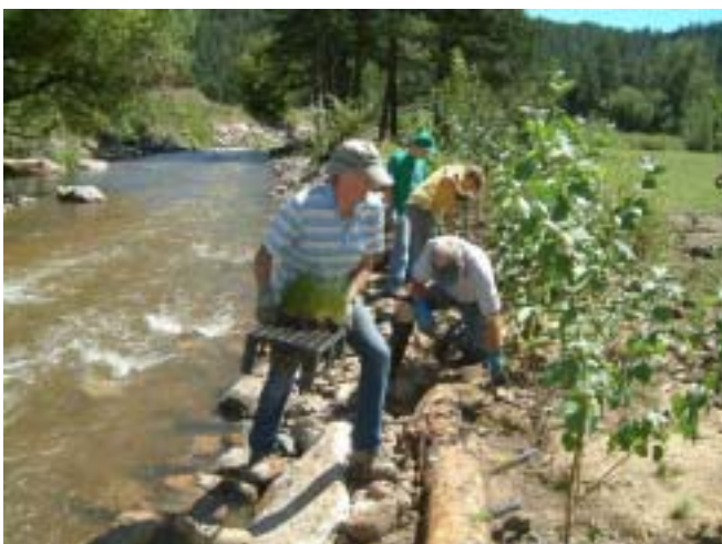
Finally, grass plugs -- nearly 3000 -- will give things a head start next Spring. Small crews made short work of 'em.