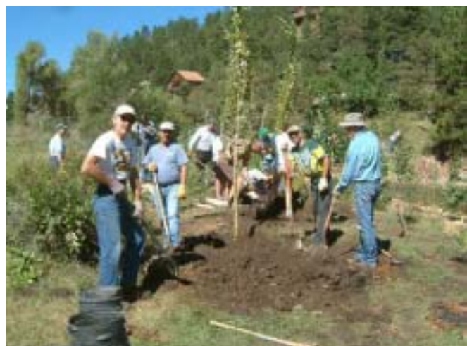
Meanwhile, another crew finishes planting a narrow-leaf cottonwood. It took six of 'em to get it into the wheelbarrow!