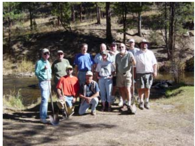
The Dirty "Fisherman's Dozen"